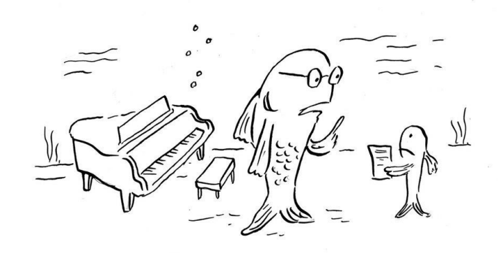
"Sorry, son— in order to play Liszt you would need to be an octopus."

Daily Quizzes: Every class will begin with a quiz over the assigned materials. One quiz will cover material from the readings assigned for both HIST 2322 and MUSI 1306. Quizzes may also be comprehensive and include material covered earlier in the course. The lowest two quiz grades will be dropped.